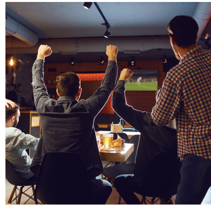
Sky Sports now Live at the Clubhouse