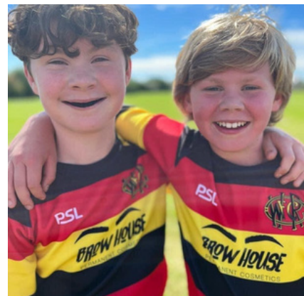
New Kits provided to all sections - no more hand me downs