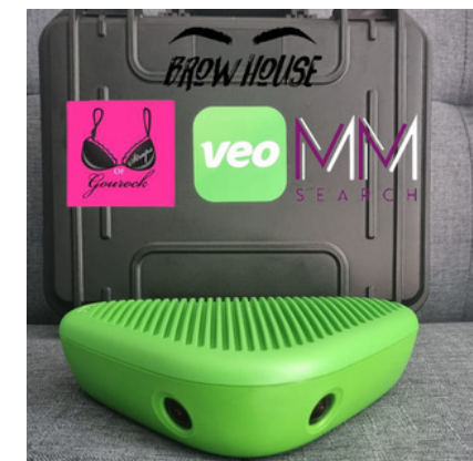
VEO Cam Purchase allowing analysis of games