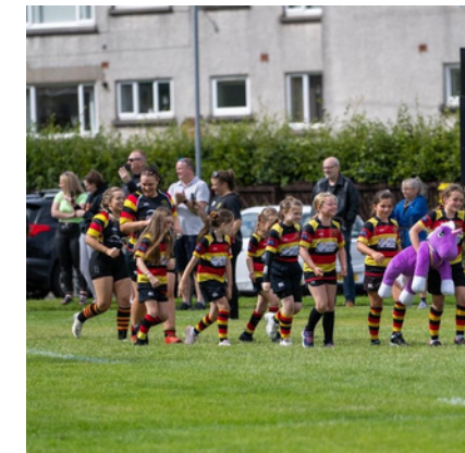
Minis Girls Growth