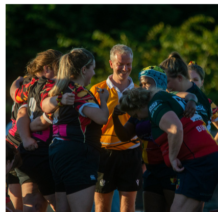
New GWRFC Match Official