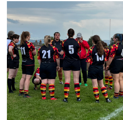
Women's 2nd XV Debut - first club based outside a city to do so