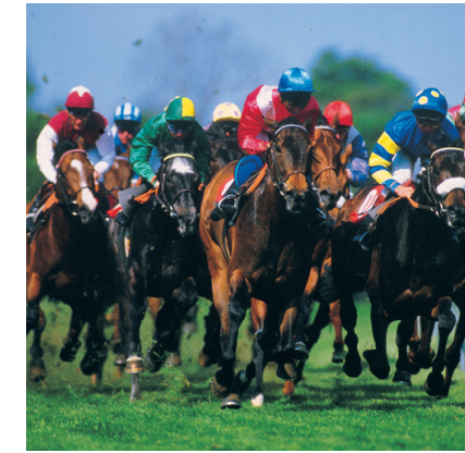
Men's Section Fundraiser Success